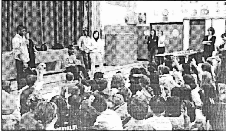
Village students look and listen intently and the Mercy First dog trainers share their experience with the dogs.

Printing imperfections present during scanning