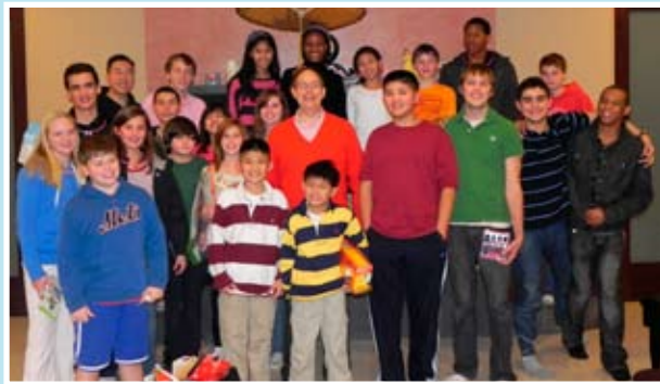
The MiHi Youth Group, a ministry of North Shore Community Church in Oyster Bay, NY.

MercyFirst is very grateful for kindness of the MiHi Youth Group and everyone is proud of the teens for being so generous and willing to help others in need. It's a wonderful lesson learned from the youth in our community.