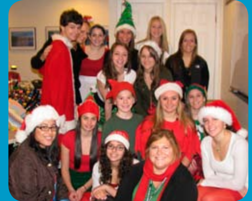
Seaford High School delivered tons of holiday toys. (above)