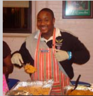
One youth is serving food that he helped to prepare for the event.

Each year, youth from MercyFirst get in the holiday spirit by volunteering to help cook and serve dinner during family visiting nights. For Thanksgiving, there are 4 nights of turkey dinners served to the families of MercyFirst, complete with all of the fixings, which the youth get an opportunity to prepare. They bake corn bread, cake, help carve the turkeys, and then take turns serving food to the families. It is truly a blessing for all those involved. It is so important for all youth to learn to give back to their communities, and the youth at MercyFirst are no exception. And what better time of year to give thanks and spread joy than Thanksgiving and Christmas? During Christmas time youth also assist in creating "Santa's Workshop" during visiting hours for 4 separate nights. They volunteer their time by acting as Santa's elves, passing out Christmas favors, taking pictures of the families with Santa Clause, and serving dinner once again. We are grateful for their energetic, selfless, and gracious participation.